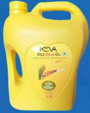
Keva rice bran oil